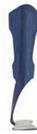
BlueROCKER® 2 ½