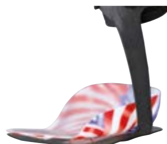
KiddieGAIT® with UCB