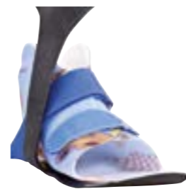
KiddieGAIT® with SMO

KiddieFLOW™, KiddieGAIT® and KiddieROCKER® should always be combined with an additional orthotic, designed to control the position of the foot.