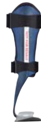
BlueROCKER® 2½ BlueROCKER® 2.0

Offered individually or in convenient "6-PACKS" (sizes S, M and L - left and right).