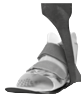
KiddieGAIT® with Surestep™

Scan or click for sizes and measurements!