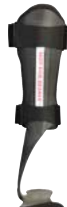
ToeOFF® FLOW 2½ ToeOFF® 2½ ToeOFF® 2.0